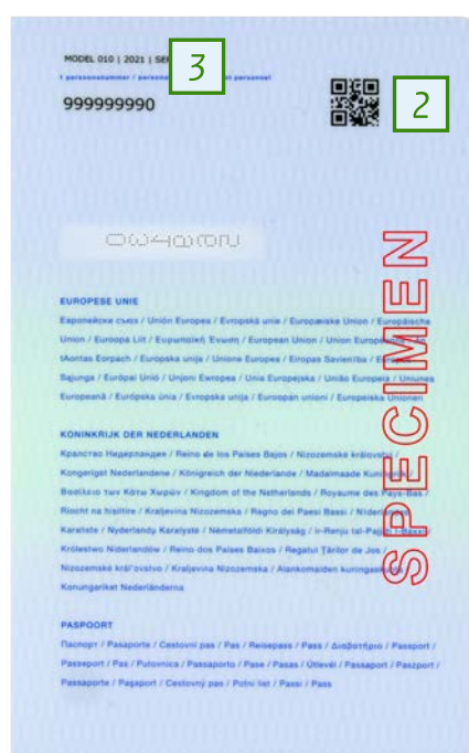
Back of biographical data page of 2021 national passport