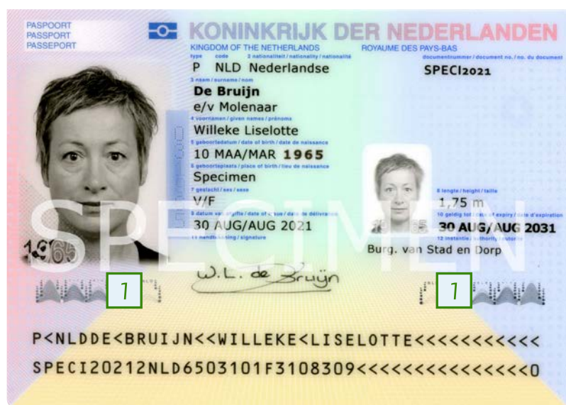
Front side of biographical data page of 2021 national passport

The following changes have been made to the front side of the biographical data page of the 2021 Dutch passport design.